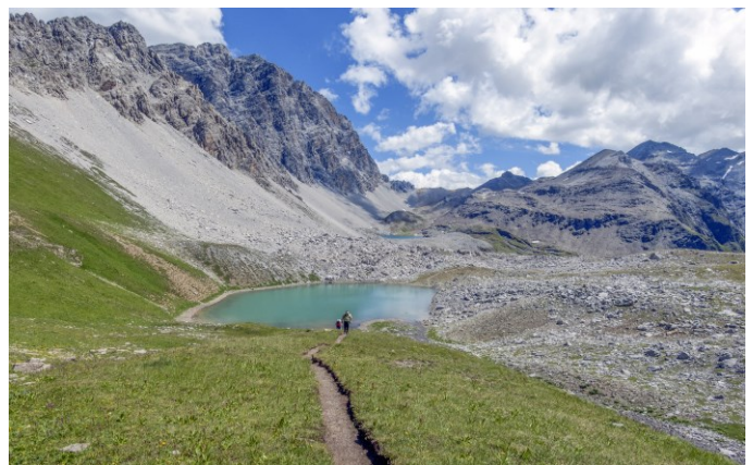
A path near Pfäffikersee.

The External Relations, Public Policy and General Partnerships programme aims to advance the themes of digital and open knowledge in society and politics at the national and international levels while helping Wikimedia CH become a recognised player within the Wikimedia Movement on themes concerning our vision and strategic impact directions. We will participate in working groups and coalitions to advance digital and open-source themes in society and politics while supporting civic action groups with our own knowledge and expertise, as well as that of relevant partners.